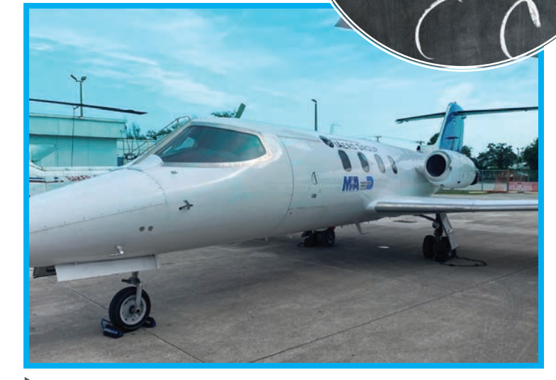
Above: 1981 Learjet 25D That was Donated to George T. Baker Aviation Technical College by iAero Tech is a Leading Airframe MRO Based in Miami, FL