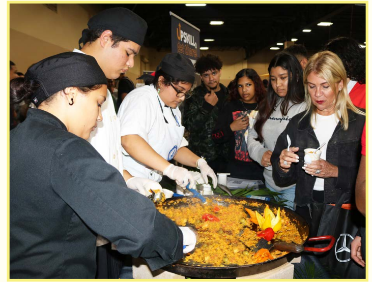
Culinary program cooks up a batch of paella