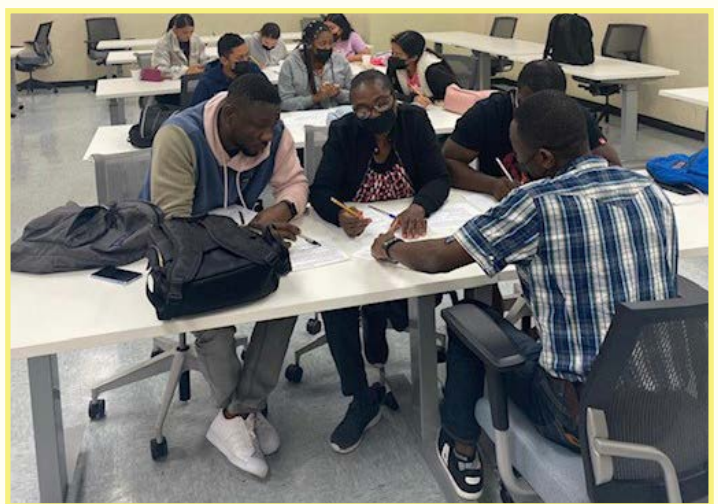
Turner Tech ESOL students learning and engaging in group activities

New wall wrap at Turner Tech Adult showcasing CTE programs Conversation Thursdays has been a huge success at Turner Tech since it started. Based on students' interviews, and academic data we were able to learn that they really enjoy the activity, and they are learning as well. Turner Tech Adult plans to continue having Conversation Thursdays so that students can continue to learn while having fun, as well as meet new