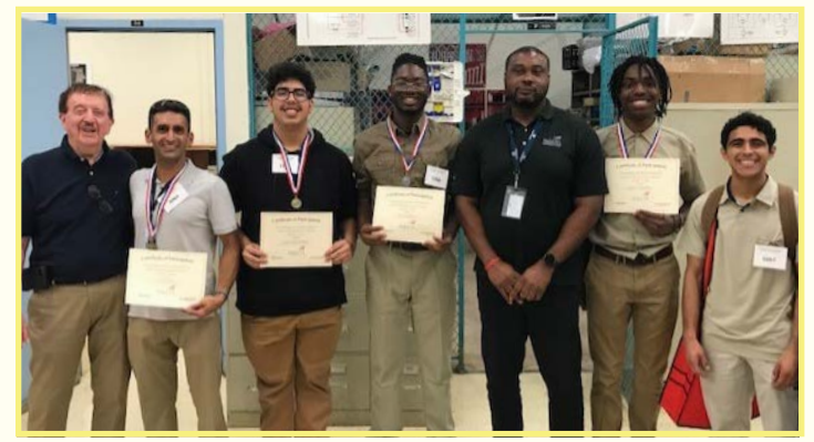
Region V SkillsUSA contest at Robert Morgan Educational Center & Technical College